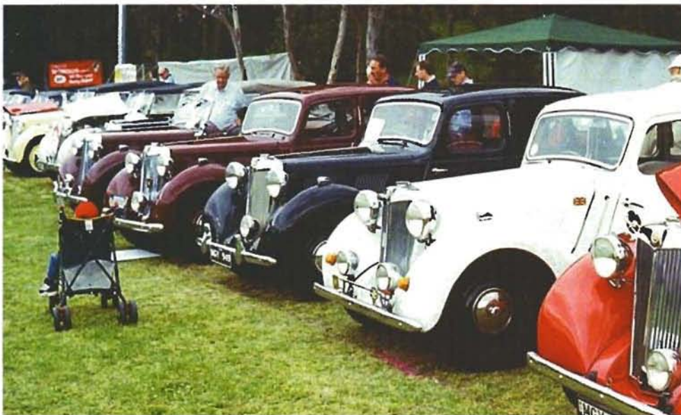
Group of Sydney cars at a club concours in Oct 2004