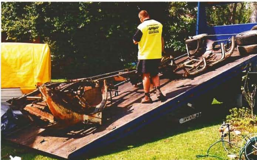
Y sedan on route back to God, left in the open for 30 years