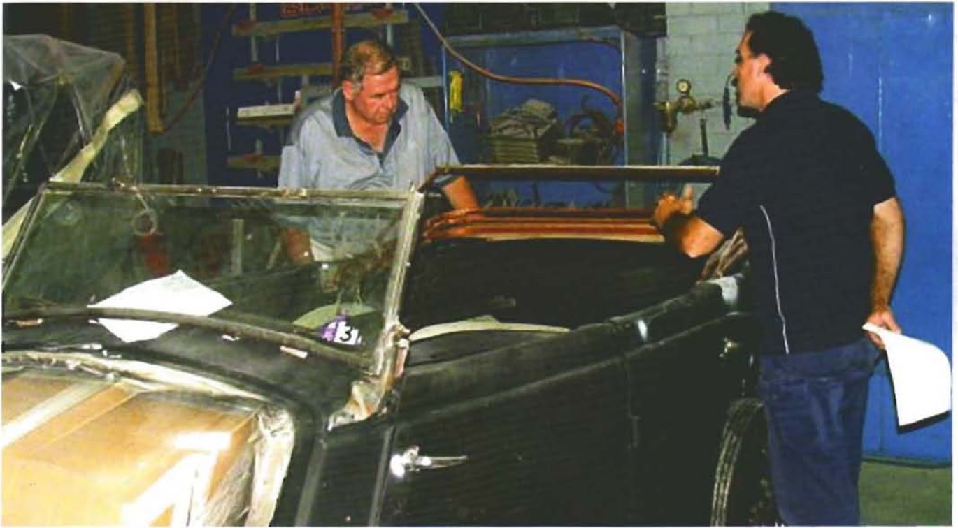
Philip Whites four-door tourer in progress