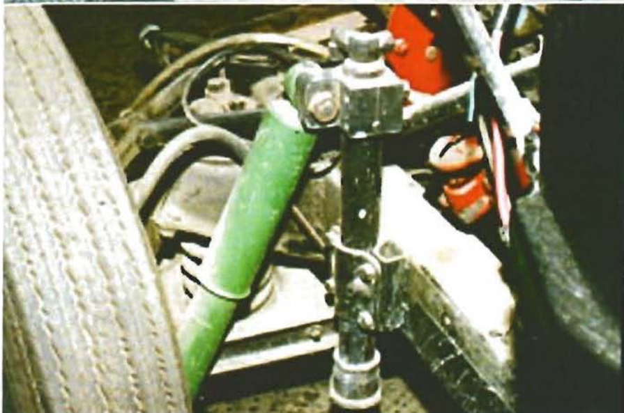
Shock absorber modification