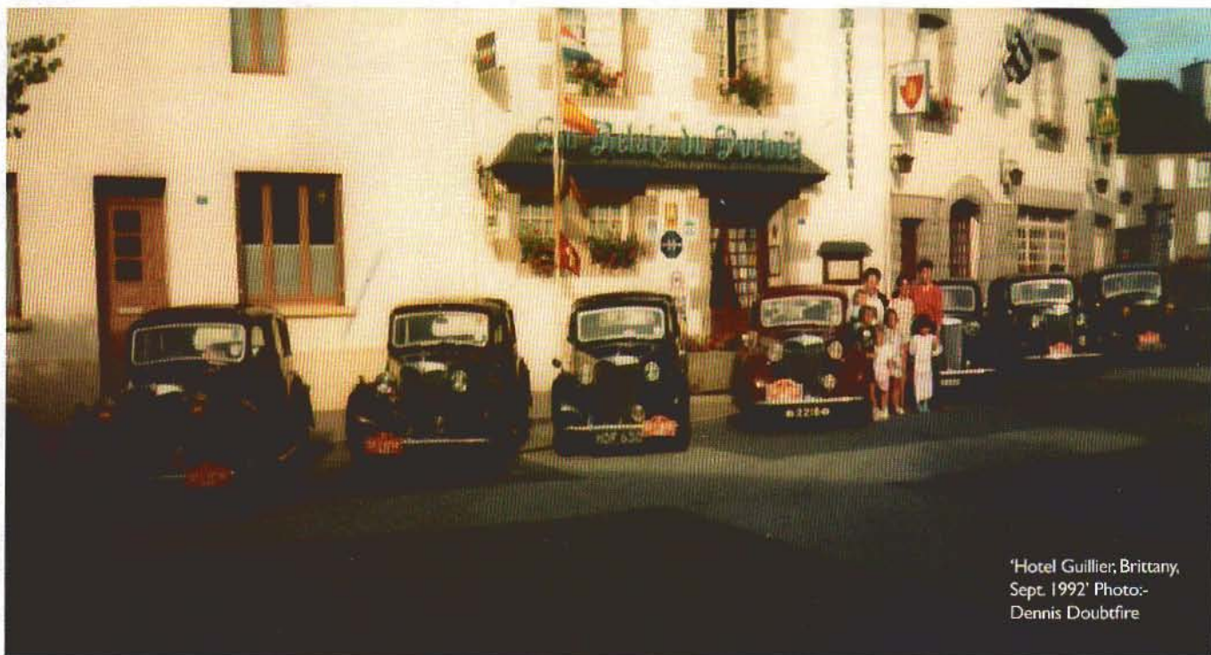
'Hotel Guillier, Brittany, Sept. 1992'