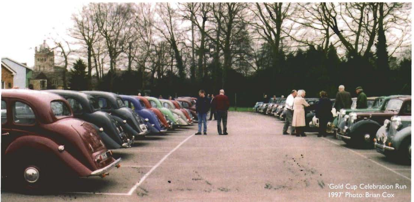
'Gold Cup Celebration Run 1997'

Hopefully, appreciation of the Y Type will continue to grow as it has since the Register was formed and our records will continue to reflect this.