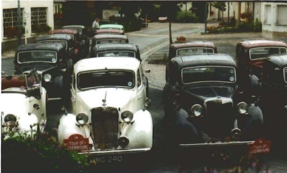
Left: 'Golden Jubilee Celebrations, Luxembourg, Aug, 1997'