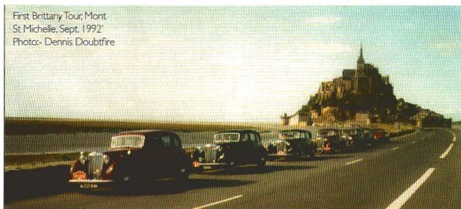
First Brittany Tour; Mont St Michelle, Sept. 1992