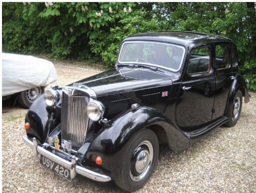
USV 420 in April 2011 showing the quality re-spray and re-chroming undertaken 24 years ago

Richard commented on the 'smart Turbo Disc wheels'. These were originally provided by Cornercroft of Coventry. I believe that these were also fitted to the MGA as an after sales market item. I am unsure whether these are available