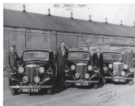
Three sequentially registered Y Types used by the MG Rally Team in 1953. HMO 909 is now part of the BMIHT collection at Gaydon