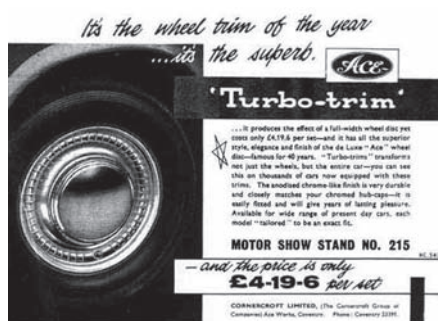
Copy of a contemporary advertisement for Ace 'Turbo-trims'

A copy of an advertisement is included when they were being promoted at the Motor Show (presumably during the 1950s). At £4 - 19s and 6 pence a set, they weren't cheap when one considers that the average weekly wage was £10.00 in 1957! It's about 40 times that now!