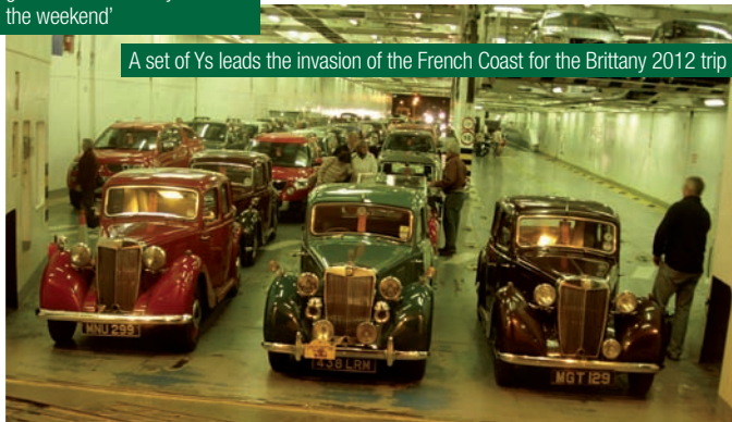
A set of Ys leads the invasion of the French Coast for the Brittany 2012 trip