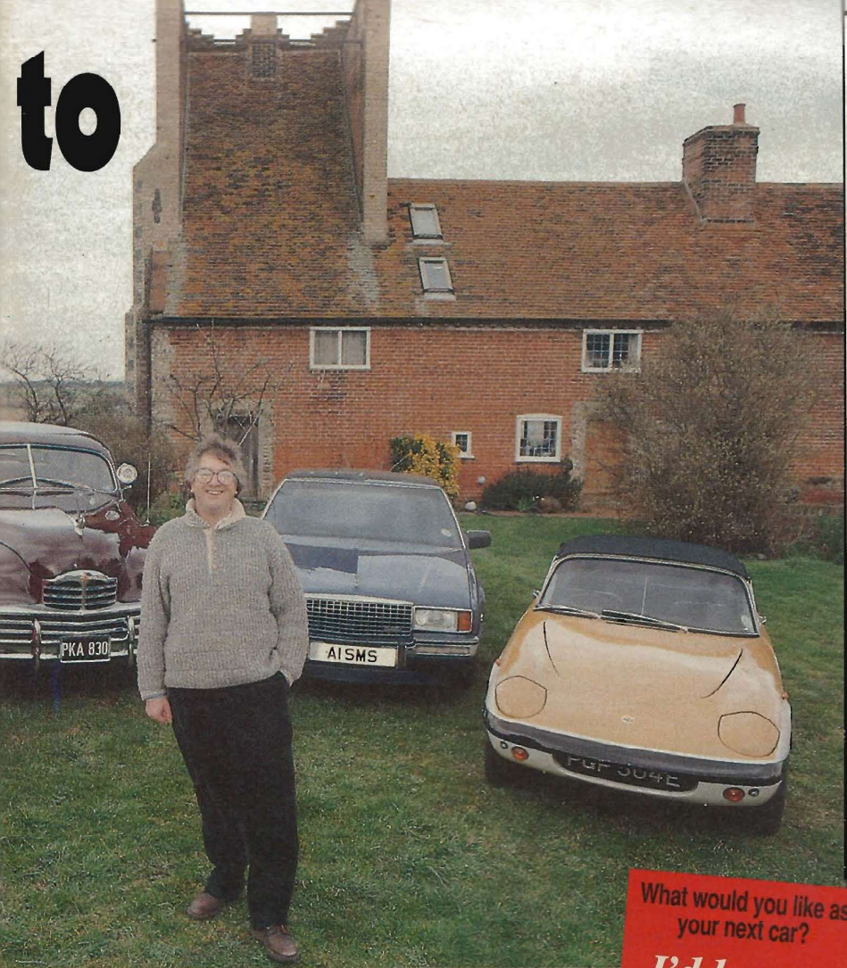
to right) an MG Y-Type, a Packard Super-8, Cadillac Eldorado and Lotus Elan