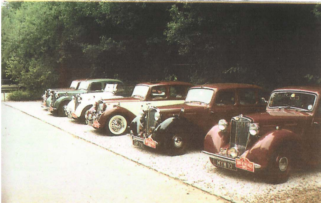
A fine collection of Y-Types at Pateley Bridge Tour of the Dales September 1993