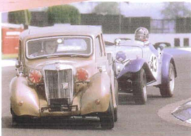
Top: Frank Vautier on two wheels in '73 trying to hold off a T-type. Bottom: suspension mods mean the car now corners much flatter.

At the front there's an anti-roll bar, lowered and stiffer springs, anti MGA stub axles and disc brakes; the dampers remain lever-arms. The rear is even less altered: lowered leaf springs and telescopic dampers are the only mods, and Frank says there's no axle tramp.