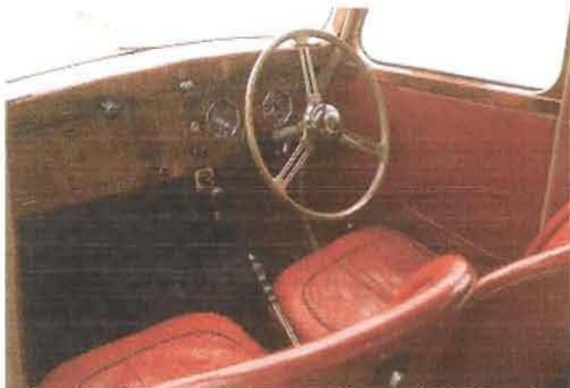
Cockpit well-equipped but narrow, with constricting footwells

The chassis gets off to a head start with that Issigonis steering. Devoid of play, it's taut, quick, instantly informative and perfectly weighted; few cars can have better. Matched to this is a chassis that's not going to win prizes for cossetting comfort but at the same time isn't brutally firm: reacting sharply to bumps, it's just what you'd expect on a sporting saloon of the