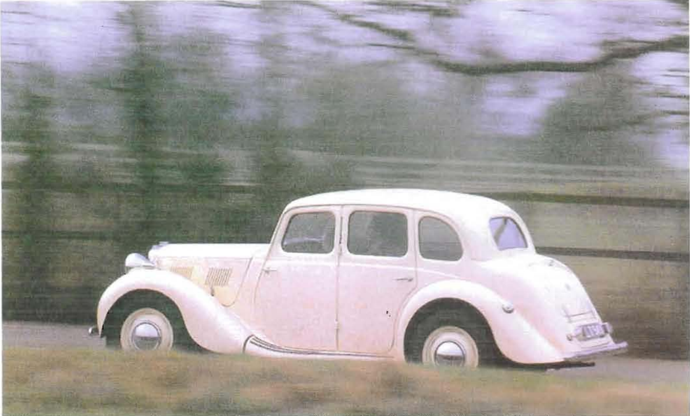
Happy 60mph cruise no problem, and on twisty roads narrow 'Y' handles beautifully. This is YA, using 16in wheels and cutaway rear wings

With this availability there's no real incentive to substitute parts from a 1952-53 YB (principal physical difference: 15in instead of 16in wheels), or indeed going over to MGA bits - and that's leaving aside the question of finding YB parts, when only 1301 YBs were built, against 6158 YAs. Mike is in any case keen to dissuade those who fancy fitting, for instance, an MGA front end with disc brakes.