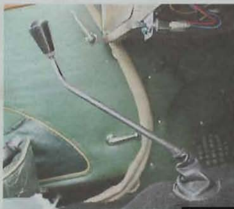
The gearchange is smooth and crisp, with effective synchromesh on third and fourth gear. The pedals are well positioned for double de-clutching for the others. Points like this make the Y-type a very easy car to drive.

I was following a map provided by the MGCC that marked out four circular test routes that all MGs built at Abingdon were taken on before being shipped to dealers before a rolling road was installed at the factory in 1975 to do the job indoors. I was following the longest circular route of just over 11 miles out onto the A420, which was used for MGB GT V8s – back in 1952 the YB would have been taken on a much shorter run of just under five miles 'just up the road and back'. And it's easy to see why the