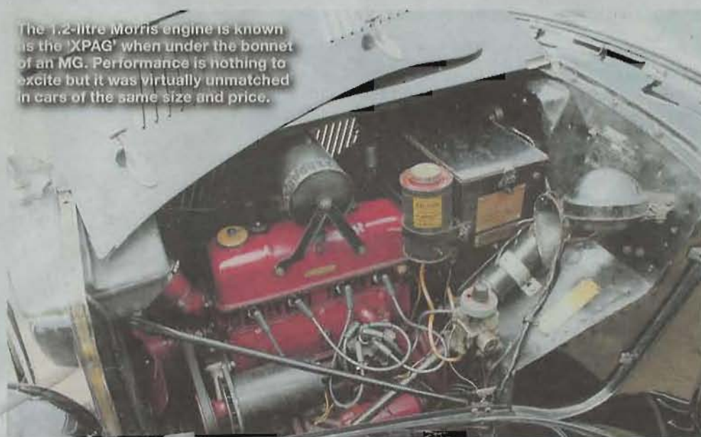
The 1.2-litre Morris engine is known as the 'XPAG' when under the bonnet of an MG. Performance is nothing to excite but it was virtually unmatched in cars of the same size and price.

uncomfortably high for the low-octane petrol available at the time and contemporary testers complained of pinking under hard acceleration and the engine running on when hot, although the trade-off was strong performance for such a relatively small car.