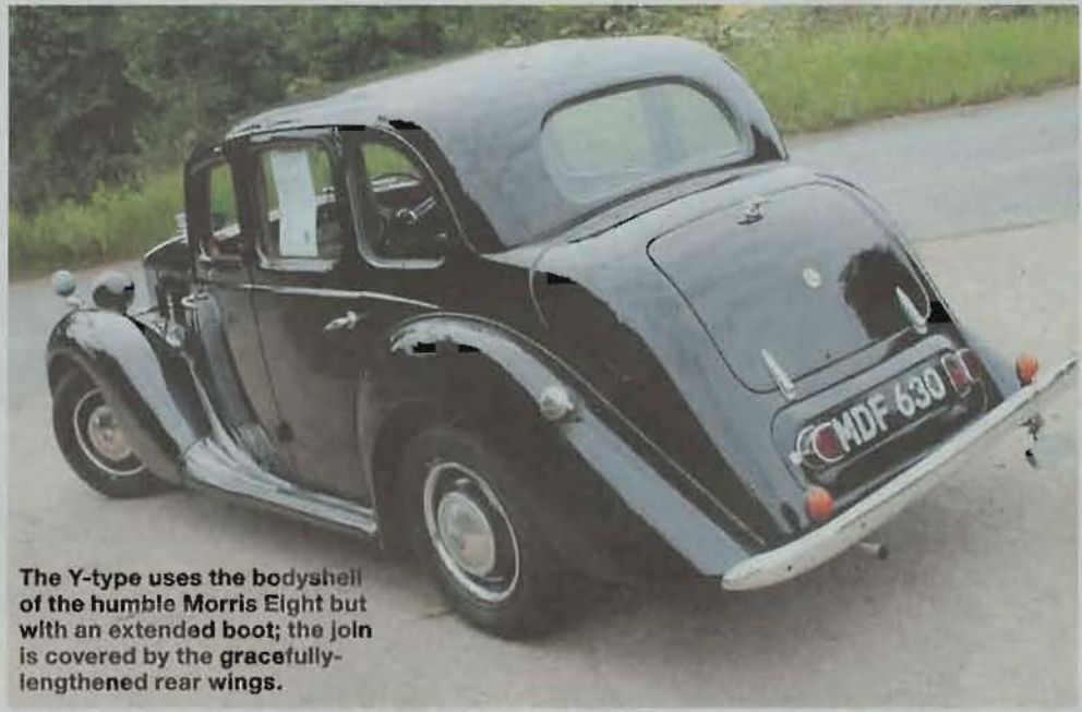
The Y-type uses the bodyshell of the humble Morris Eight but with an extended boot; the join is covered by the gracefully-lengthened rear wings.