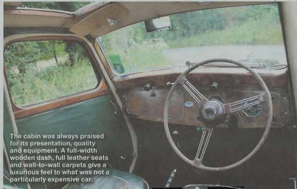
The cabin was always praised for its presentation, quality and equipment. A full-width wooden dash, full leather seats and wall-to-wall carpets give a luxurious feel to what was not a particularly expensive car.