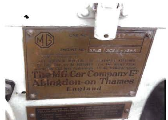
Detailing still remains such as this identification plaque