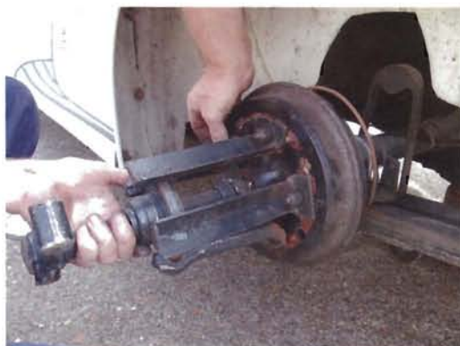
Drive shaft breakages are said to be common; needs a puller too

Sadly, the jackall had been removed from our car before we acquired it but I suppose we should be grateful about this as the reduced weight does make my car a bit lighter and more nimble.