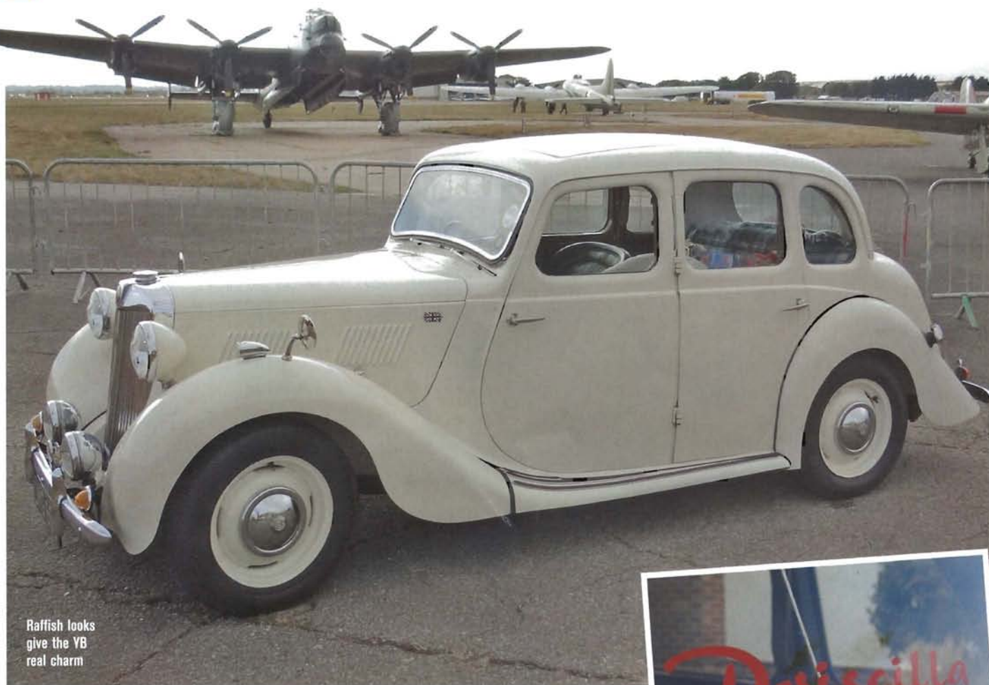
Raffish looks give the YB real charm