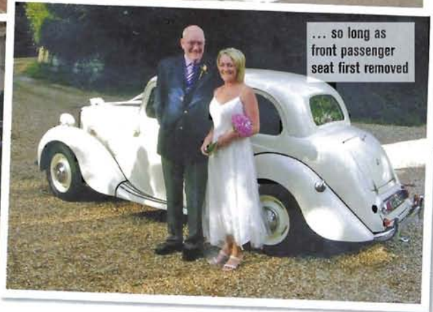
... so long as front passenger seat first removed

Steering is an unassisted standard rack and pinion layout (and who thinks adjustable steering columns are a new idea – the Y Type had it in 1947) which is light on the move but needs some muscle to manoeuvre at low speeds.