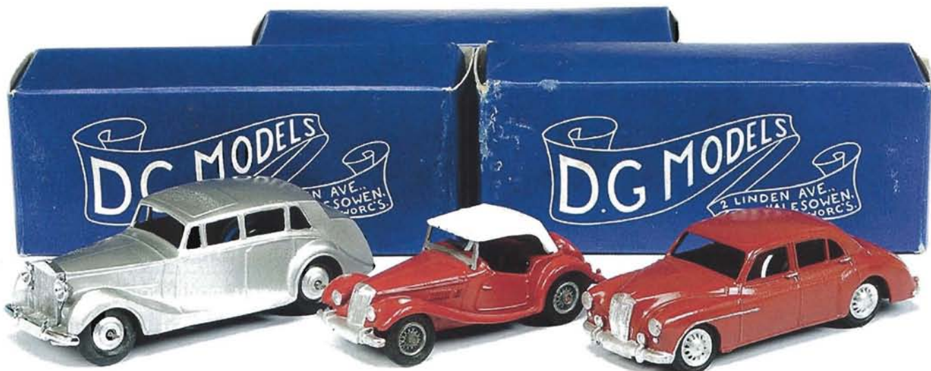
Two more D.G. MG models: TF (left) and ZA in red (right), shown beside a Rolls Royce.