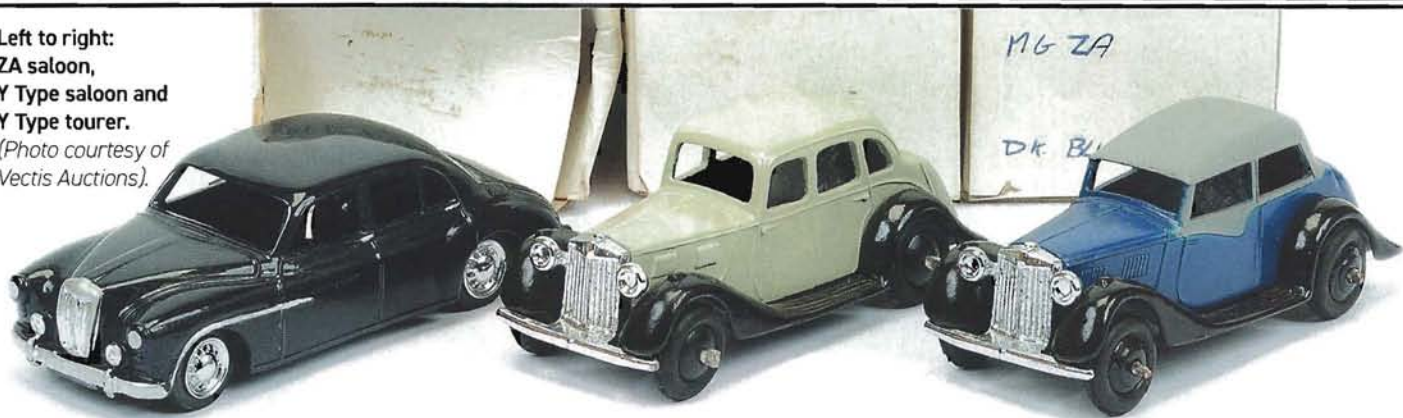
Left to right: ZA saloon, Y Type saloon and Y Type tourer.