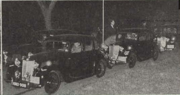
The same three cars as on the left lined up in a different order at the Prescott test, held on the earlier stages of the famous hill.