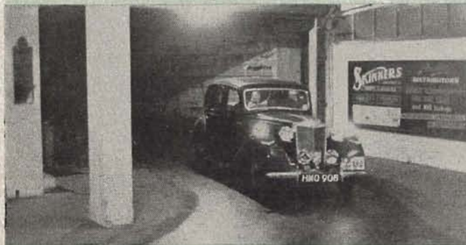
Reg Holt (M.G. 1 1/4 litre) swings down into the underground car park at Hastings, at the end of the long road section.