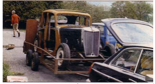
A sad looking MG Y-Type in need of restoration.