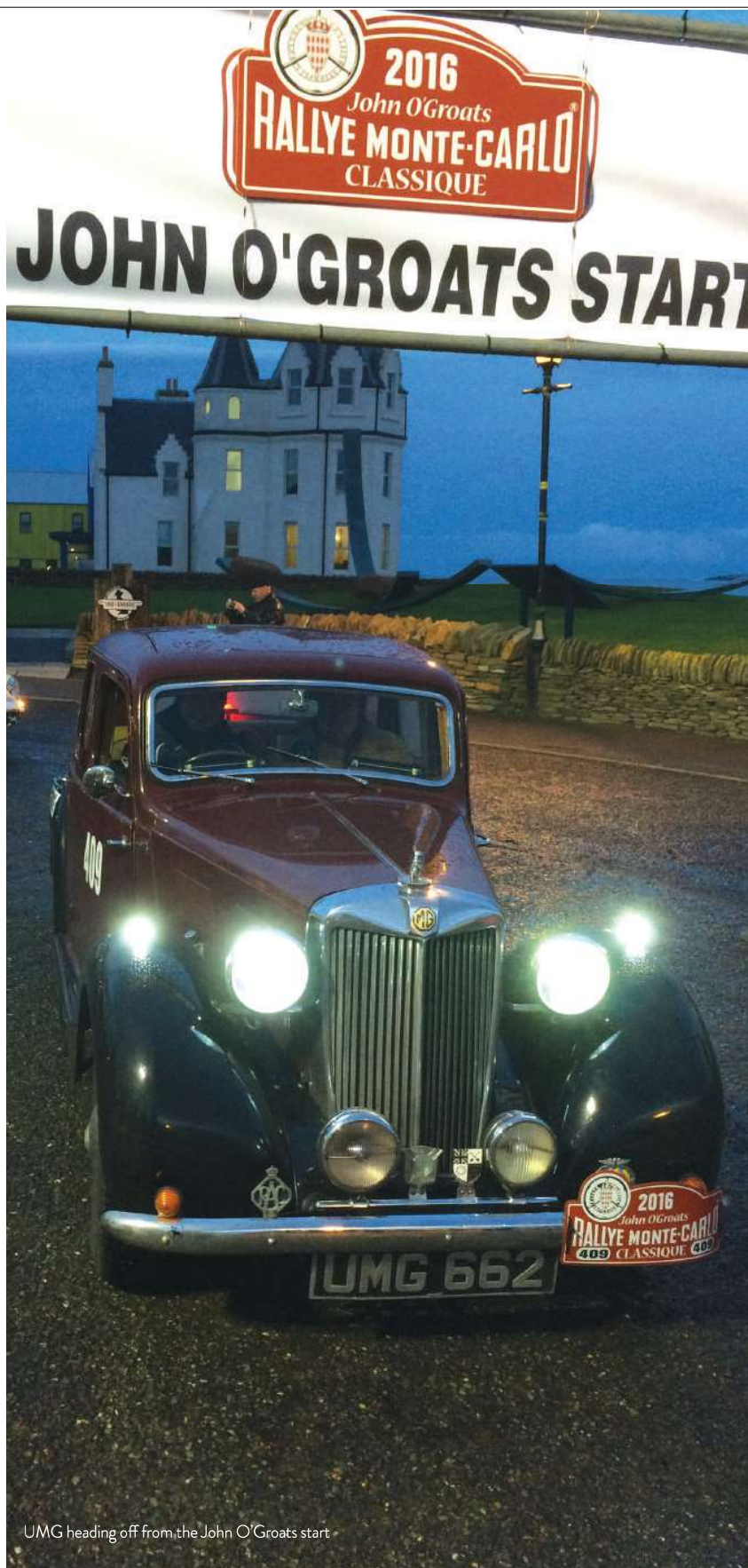
UMG heading off from the John O'Groats start