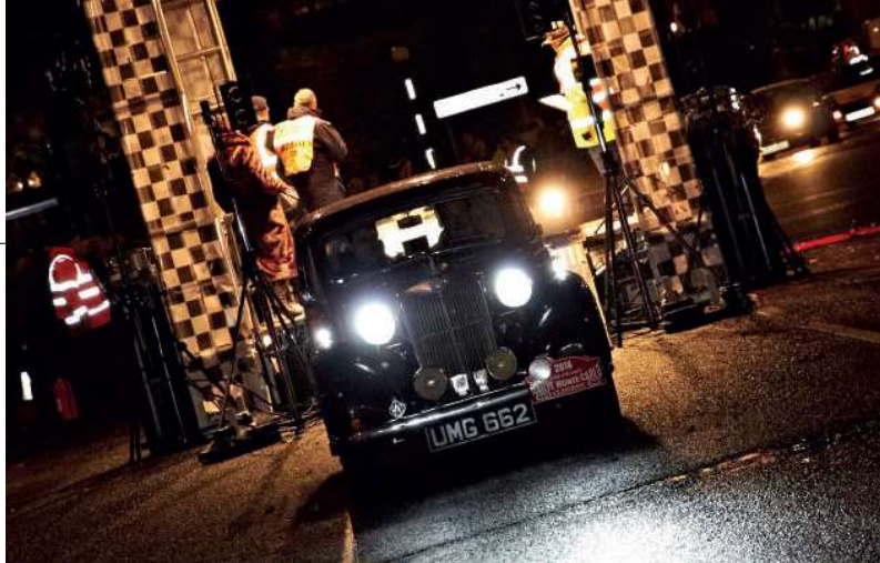
UMG 662 heading out from the Paisley Start

Gleneagles during the Coronation Rally. This was probably the first time the car had been back in 63 years.