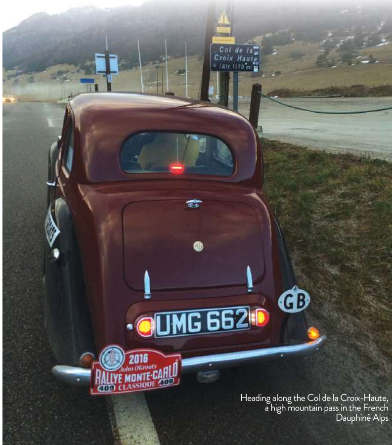
Heading along the Col de la Croix-Haute, a high mountain pass in the French Dauphiné Alps

After arriving late in the evening at Calais, we were keen to find somewhere to catch a few hours' sleep before heading off to Rheims early the next morning. Alas, all the hotels near the coast were full and we were lucky to be able to get the last couple of rooms at a motel near Arras. Whilst that meant we did not get much sleep, it did mean the drive to Rheims the next morning was relatively quick. In Rheims we faced a dilemma – start cracking on south or follow the Historique cars after their start from Rheims that evening? As there was