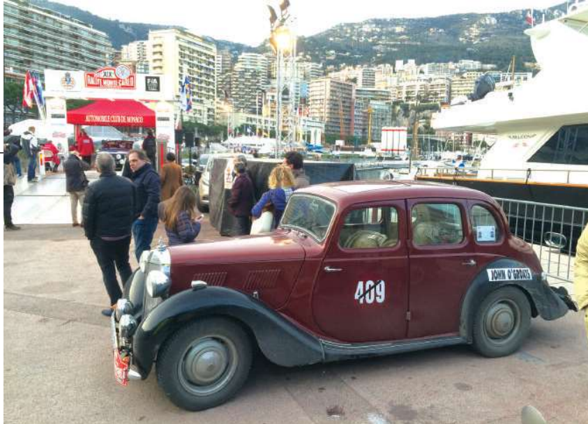
A triumphant Y Type at the finish

The route from Saint Andres-les-Alpes to Monaco was relatively straightforward and downhill all the way. Within a few hours, we reached Nice on the coast, where it was sunny and a good 10 degrees warmer than up in the mountains. As we were so close to Monaco we decided to sprint to the finish by taking the péage from Nice to the principality. What we had not recalled was that the 30 or so miles to Monaco from Nice is for the main part uphill. The strain on the engine pulling the car uphill non-stop for 30 minutes in the warm air caused her to overheat. We pulled over some 10 miles from Monaco and let her cool down a bit. To her credit, this was the only trouble we had on the whole trip. Once we had cooled down a bit, we very gingerly motored on to La Turbie, where we turned off the péage and coasted down several thousand feet to the finish line at Monaco harbour. When we arrived at the finish we found the ACM still setting up. We were