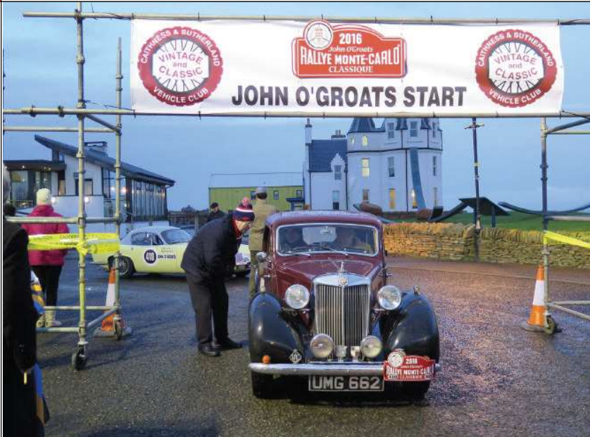
Readying for the start of the 2016 Rallye Monte-Carlo Classique