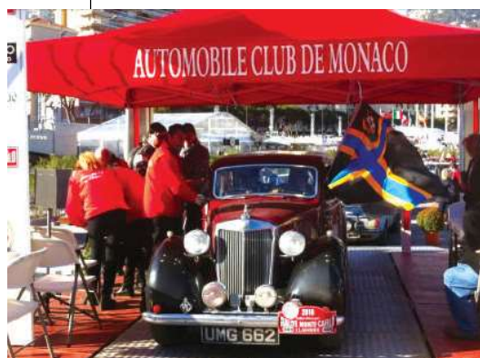
The finish of the 2016 Rallye Monte-Carlo Classique