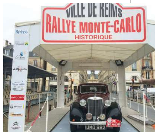
Ready for the start from the Rheims ramp