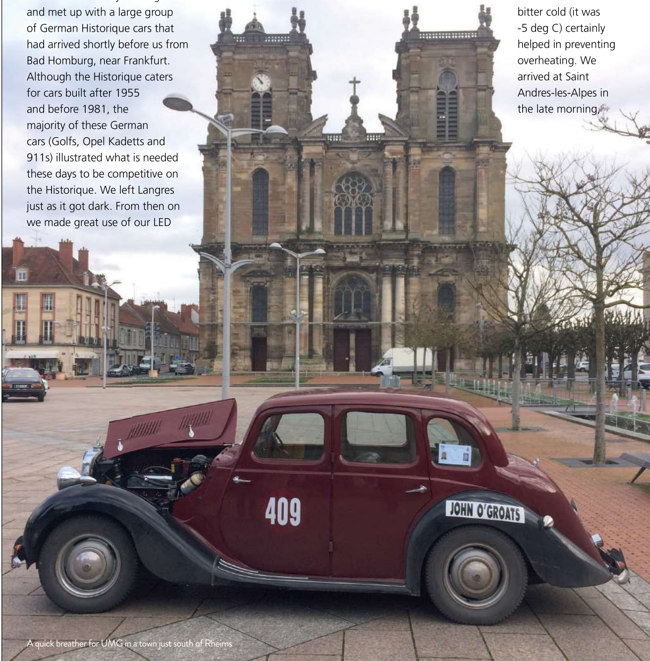
A quick breather for UMG in a town just south of Rheims

in second. The bitter cold (it was -5 deg C) certainly helped in preventing overheating. We arrived at Saint Andres-les-Alpes in the late morning,