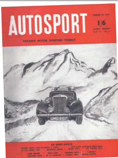
UMG 662 on the cover of Autosport, January 1954

completed the entire rally, they were sadly disqualified for missing the last time check.