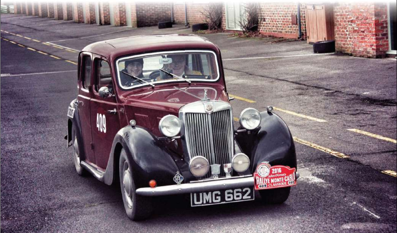
The Y Type and occupants enjoying the Croft Circuit